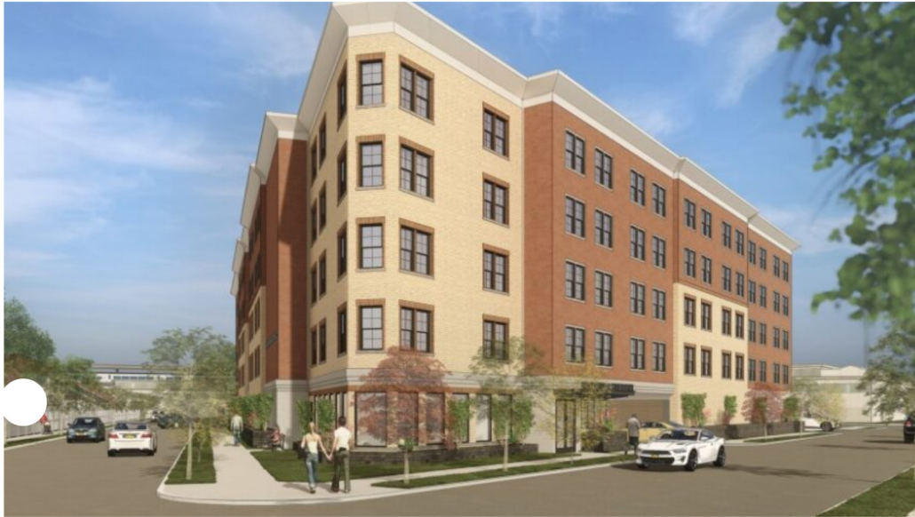
Rendering of the Bishop Ronald H. Carter Manor in Freeport.

Home(/) > News(https://Libn.Com/Category/News/) > Real Estate(https://Libn.Com/Category/News/Real-Estate/) > Affordable senior housing project planned for church property